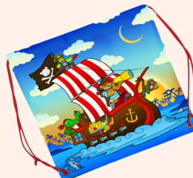
BP302—Bear Pirate Ship